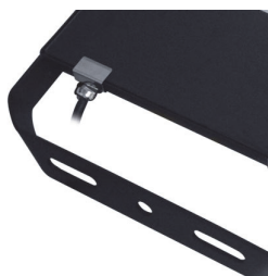
Lyre de fixation pré percée